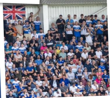
The home of the shouting men