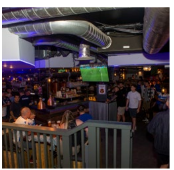
The Factory has bacon rolls for sale for £4 near the bar for Saturday afternoon games, and sausage rolls for evening fixtures.